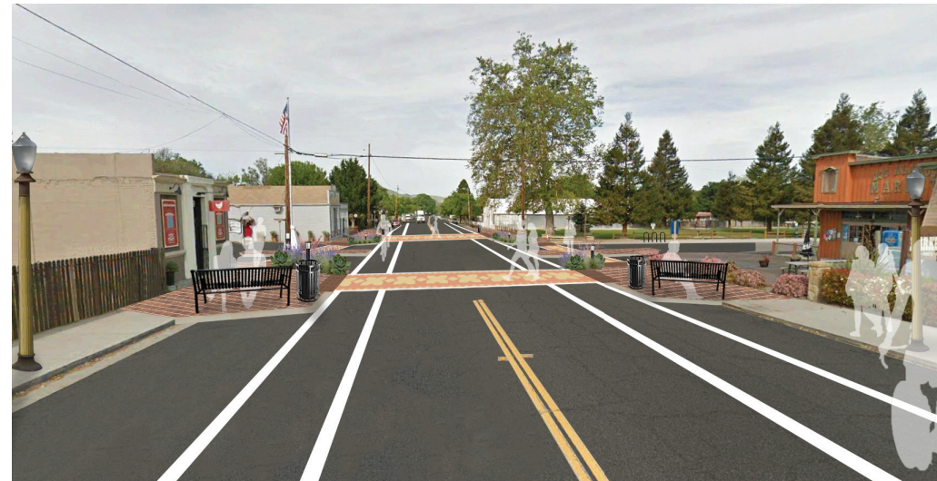
Project Rendering. Final Design subject to change.

The Los Alamos Connected Community Project will benefit the community by increasing walking and bicycling, dedicating space for bicyclists, providing new intersection lighting, and providing a safe, convenient and comfortable active transportation corridor for people of all ages, abilities, and incomes. It will also provide safe routes to school and safe routes for seniors.