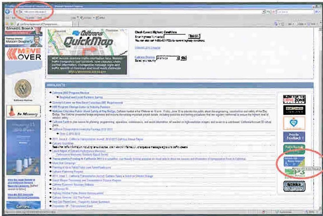
Caltrans Internet Home Page With ADA Access Request Button