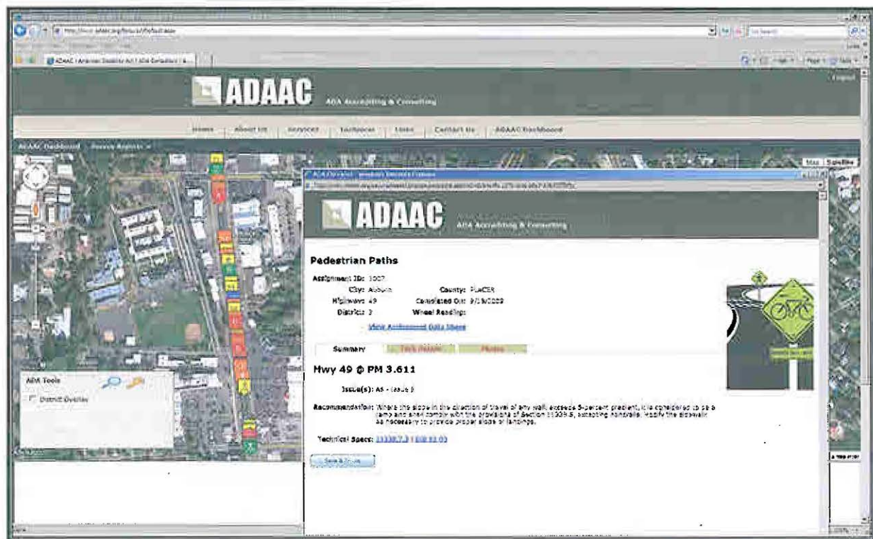
Multiple ADA Transition Plan Locations Displayed in a Google Earth Format

In 2009 Caltrans contracted the services of ADA Accrediting & Consulting to assess Caltrans' pedestrian infrastructure along the State Highway System and to develop an updated ADA compliance transition plan. The assessment of 4,000 miles of sidewalks and street crossings was completed in June 2011. More than 30,000 noncompliant locations were identified and included in Caltrans' ADA transition plan in a database form for public viewing and for use as a project development tool. The transition plan can be accessed at < http://www.adaac.org/secured/asset/caltran/TransitionReport.aspx?mode=public >.