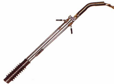
Figure 3. LA*B Flameless Heat Lance