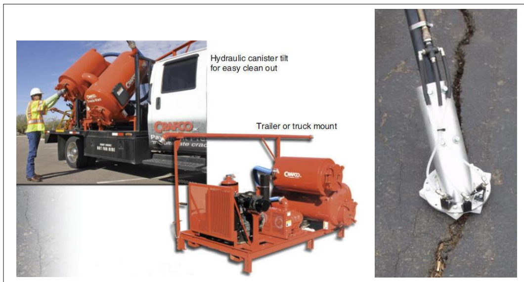
Figure 4. Crafcro Crack-Vac™

Caltrans will sometimes spray herbicide on vegetation growing in highway pavement cracks as a crack preparation method weeks prior to either conducting additional cleaning methods or applying sealant. Killing the vegetation helps any follow-up cleaning methods more easily remove the vegetation. Also, applying hot sealant to a crack filled with living vegetation only kills some of the vegetation. A significant amount of the heartiest weeds will survive and begin growing through the seal. Spraying the vegetation prior to sealing greatly reduces the chance that the weeds will survive and grow through the seal, especially in cases where no additional cleaning is performed after the spraying. Vegetation in cracks on the highway is most prevalent outside the traffic lanes.