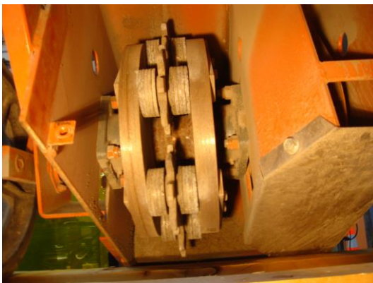
Figure 5. Impact Router Cutter Head

The impact router is the most commonly used device when cutting AC pavements to create a sealant reservoir. DOTs in the northern regions of the country utilize impact routers extensively when crack sealing on AC pavements to mitigate the greater thermal cycling of working pavements in these more extreme climate zones. A standard impact router utilizes carbide-tipped star cutters mounted free-spinning radially around a cutting drum driven by a gasoline engine (Figure 5). These self-contained routing devices are steered by a worker on foot along a pavement AC crack or joint, typically cutting a ¾-inch wide by ¾-inch deep sealant reservoir. The equipment is relatively heavy, making it strenuous work, and it also may produce a dust cloud that obscures workers' visibility. The impact router shown in Figure 6 has an optional dust collection system to reduce the negative effects of creating a dust cloud. Together with the cost of the expendable cutters and the awkward cutter change process, impact routing is a fairly expensive operation.