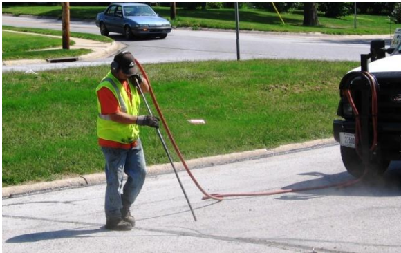
Figure 2. Compressed Air Blast Crack Cleaning