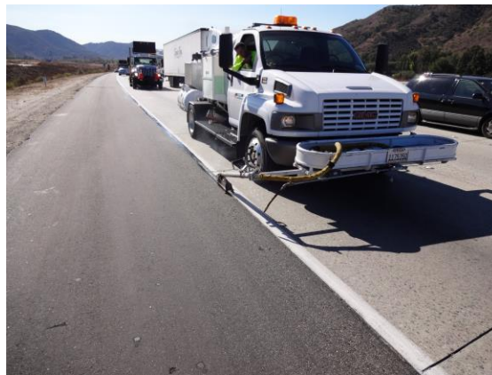
Figure 14. Caltrans District 11 Sealzall Sealing Interstate 15

The Sealzall (Figure 14) is a fully self-contained vehicle designed to dispense rubberized hot-applied sealants from an on-board 400 gallon, oil-jacketed kettle. When configured for longitudinal crack sealing, the Sealzall machine is ideally suited to seal the transition joints between PCC slabs and AC shoulders. The clip-on longitudinal sealing head has an integrated squeegee that produces a desirable uniform and smooth seal appearance. The Sealzall can seal longitudinal cracks at a continuous speed up to 5 mph, which is more than double the speed of the conventional manual sealing operation. Moving lane closure longitudinal crack sealing is a key factor in the dramatic production rate increase that Caltrans has experienced when utilizing the Sealzall machine. Automation of the sealant kettle and sealant application systems provides the driver with full control of the complete sealing operation from inside the truck cab. Utilizing the Sealzall enables smaller Caltrans crews to effectively seal an expanded range of highway cracks which would otherwise be unrealistic to access and seal with conventional manual operations.