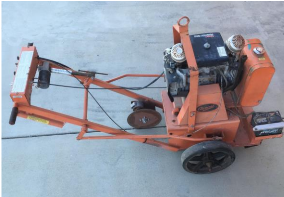
Figure 7. Impact Router Longitudinal Guide Disk

(Figure 7). This enables the router to travel at the maximum cutting speed of up to 2 mph when removing mostly debris and vegetation, based on testing. An image of the test guidance disc trials on a standard configuration impact router is shown in Figure 8. At cutting speeds much above 2 mph, the impact router cutter tended to rise out of the crack and walk across the pavement surface.