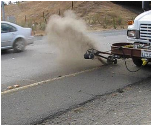
Figure 10. Sealzall Wire Wheel Attachment

The only record or report pertaining to vehicle-mounted cleaning attachments found during this PI involved the Sealzall research and development program [3]. These hydraulically-powered attachments mounted to the Sealzall platform were tested by Caltrans on State Route 4 in a moving lane closure operation (Sealzall machine described later). The attachments consisted of a wire wheel version (Figure 10) and a carbide-tipped circular saw version (Figure 11). These attachments accomplished the task of removing debris and vegetation from the longitudinal transition joint but took four times as long to prepare the joint as the Sealzall took to seal it.