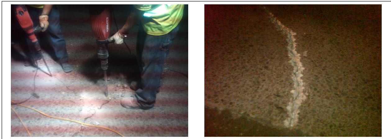
Figure 9. Rotary Hammer PCC Crack Preparation