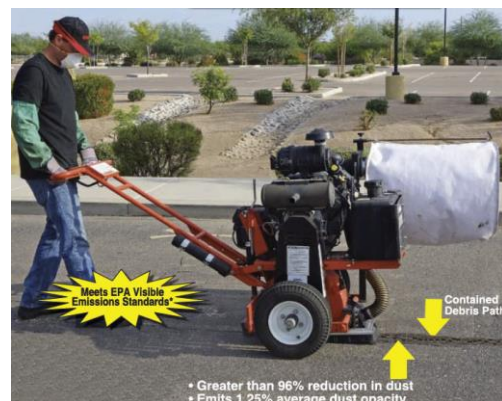
Figure 6. Dust-Contained Impact Router Cleaning a Random AC Joint

Routing a longitudinal transition joint is an easier task than routing a random in-lane crack since the PCC edge is relatively straight. Steering the router is less difficult and, in most cases, a guide wheel can be added to make the cutting head self-track along the longitudinal crack