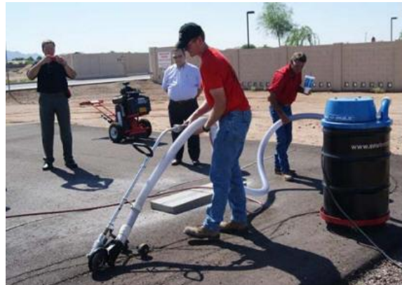
Figure 12. Crack Cleaning Device (CCD)

lance, wire brush, and vacuum into a single implement (Figure 12). The CCD is being developed at the University of Nebraska-Lincoln and may be marketed by Crafcro Mfg. in the near future [4].