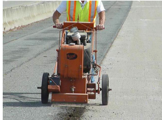
Figure 8. Impact Router Cleaning a Longitudinal Joint