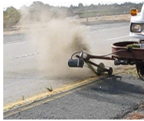
Figure 11. Sealzall Carbide-Tipped Circular Saw Attachment