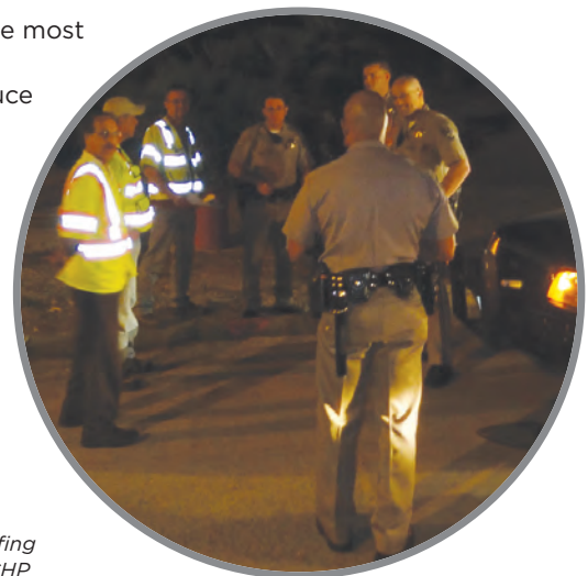
Pre-test safety briefing with Caltrans and CHP

The goal was to determine the most effective way to deploy CHP officers in work zones to reduce traveling speeds and develop methods to evaluate collision data to assess whether speed reduction improves the safety of highway work zones.