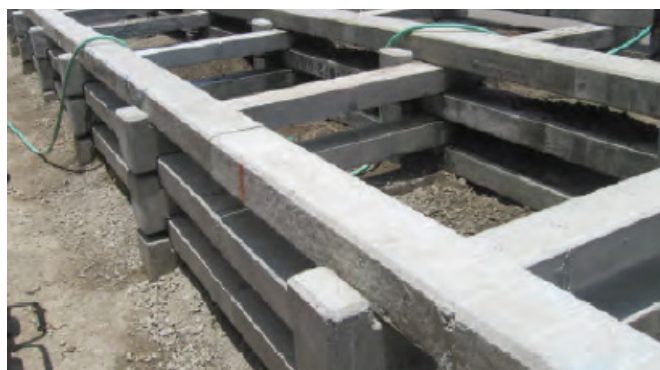
Figure 2: Precast concrete crib walls