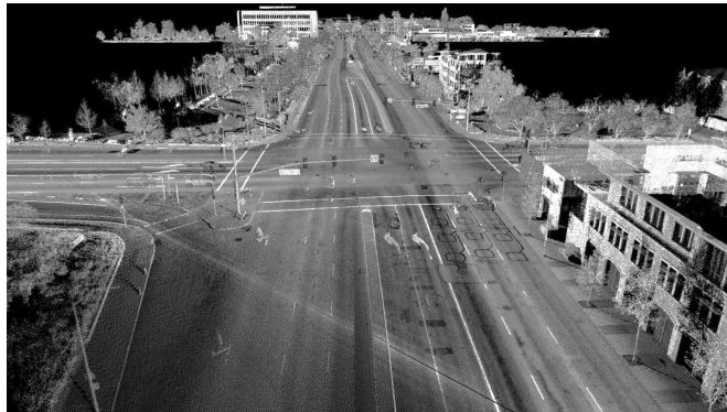
Image 5: Point cloud rendering of the El Camino Real Blvd & Page Mill Rd Connected Vehicle Smart Intersection