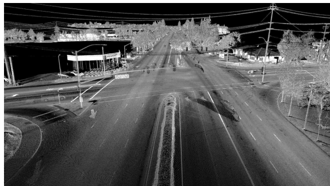
Image 6: Point cloud rendering of the El Camino Real Blvd & West Charleston Rd Smart Intersection

The contents of this document reflect the views of the authors, who are responsible for the facts and accuracy of the data presented herein. The contents do not necessarily reflect the official views or policies of the California Department of Transportation, the State of California, or the Federal Highway Administration. This document does not constitute a standard, specification, or regulation. No part of this publication should be construed as an endorsement for a commercial product, manufacturer, contractor, or consultant. Any trade names or photos of commercial products appearing in this document are for clarity only.