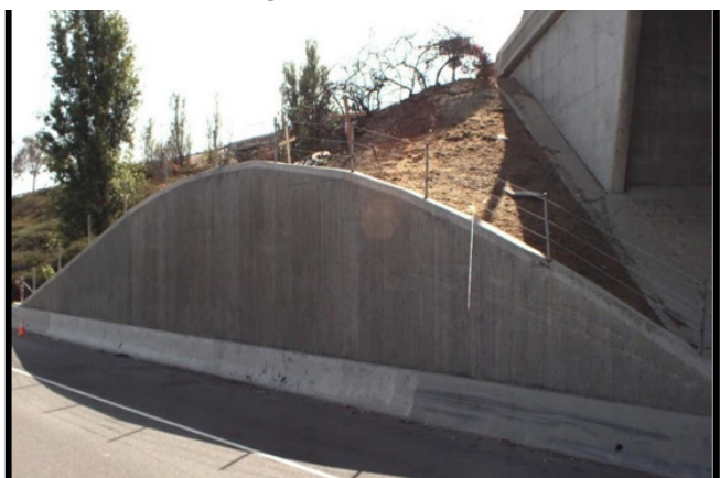
Image 3: An MX8 MTLs system camera image of a vehicle accident site: embankment on SR-74 in District 12