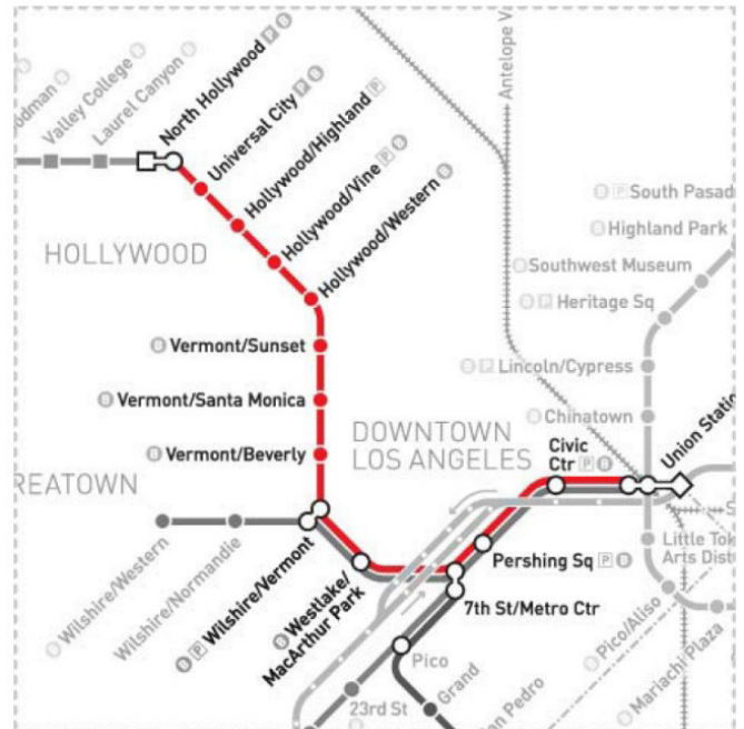
FIGURE 2: Los Angeles Metro Red Line

The contents of this document reflect the views of the authors, who are responsible for the facts and accuracy of the data presented herein. The contents do not necessarily reflect the official views or policies of the California Department of Transportation, the State of California, or the Federal Highway Administration. This document does not constitute a standard, specification, or regulation. No part of this publication should be construed as an endorsement for a commercial product, manufacturer, contractor, or consultant. Any trade names or photos of commercial products appearing in this document are for clarity only.