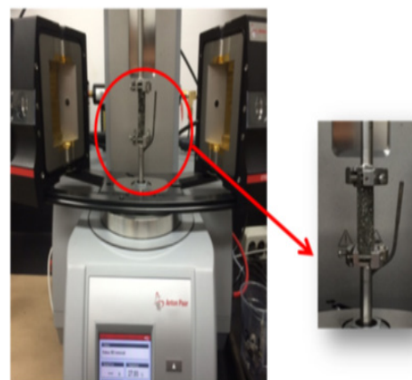
Image 2: The FAM testing setup: a dynamic shear rheometer (DSR) with a torsion bar fixture.