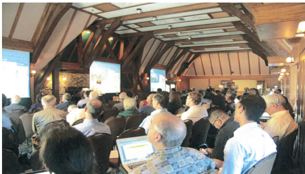
FIGURE 1: UCLA Lake Arrowhead Symposium on the Transportation - Land Use - Environment Connection