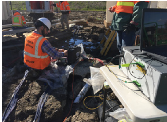
Image 2: Fiber-optic interrogator (on right). Conventional strain gauge cabling in gray (1 cable per strain-gauge.)

The contents of this document reflect the views of the authors, who are responsible for the facts and accuracy of the data presented herein. The contents do not necessarily reflect the official views or policies of the California Department of Transportation, the State of California, or the Federal Highway Administration. This document does not constitute a standard, specification, or regulation. No part of this publication should be construed as an endorsement for a commercial product, manufacturer, contractor, or consultant. Any trade names or photos of commercial products appearing in this document are for clarity only.