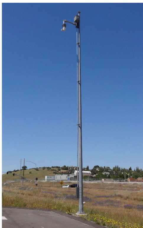
Picture 1: External-Type CLD System, US-50 at El Dorado Hills Boulevard