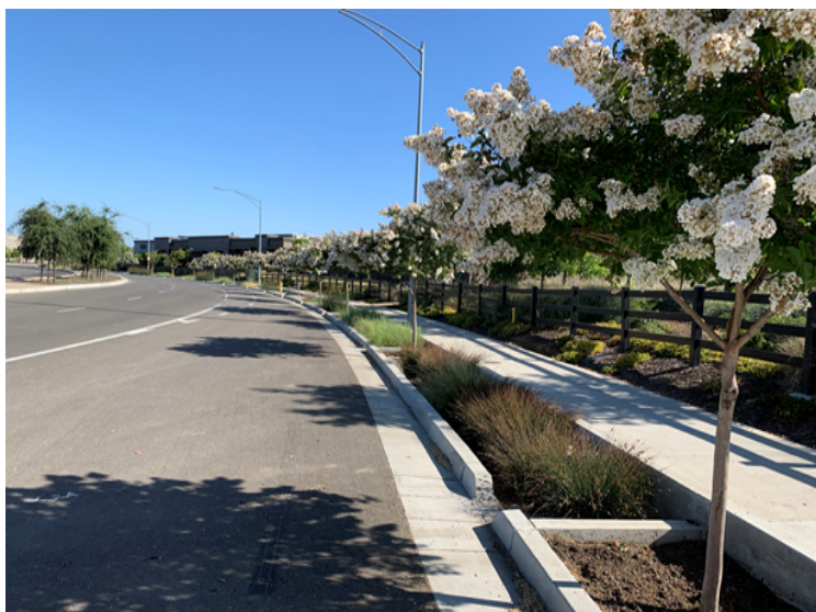
Image 2: Biosrips and Street Trees Along Cherry Avenue in San Jose, CA