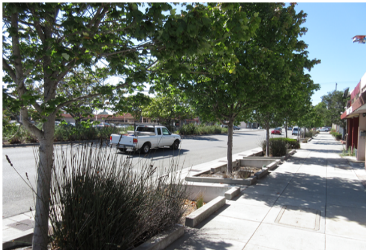
Image 1: Recently Installed Elm Trees and Biosrips Along the East Side of San Pablo Avenue Between Lincoln Avenue to Eureka Avenue Looking North in El Cerrito, CA