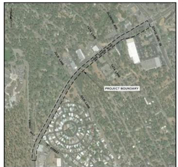
Lake Tahoe Boulevard Class 1 Bicycle Trail